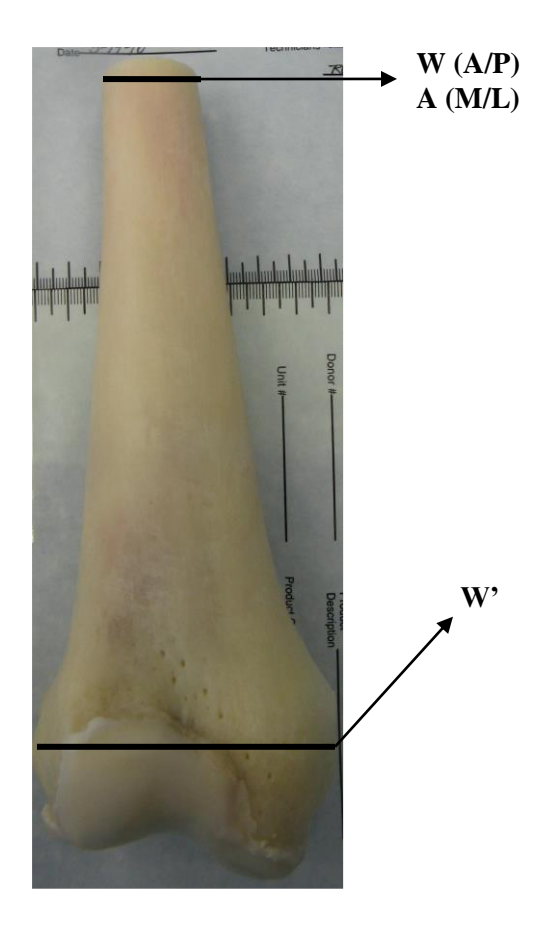
FG -325 © 2018